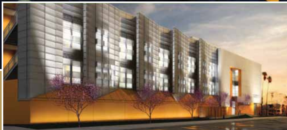
Oscar de la Hoya Ánimo Charter High School

Students Accepted into Four-Year Universities