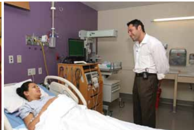
The Oscar de la Hoya Foundation collaborates with White Memorial Medical Center to provide many free and low-cost health services to the community.